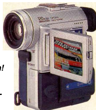
Oooh Aaaah! Sony's New Digital Handycam - Page 4.