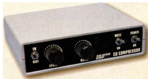
CD Compressor For Cars Or The Home - Page 62.