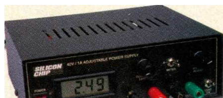
Li'l PowerHouse Switchmode Power Supply - Page 56.