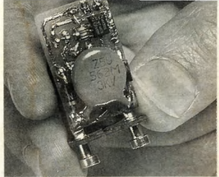
ELECTRONIC STARTER FOR FLUORESCENT, LIGHTS – PAGE 14