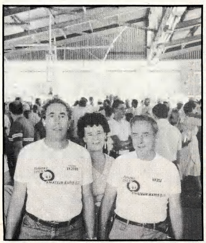
Above: Having a ball at Gosford Field Day — story Page 36.