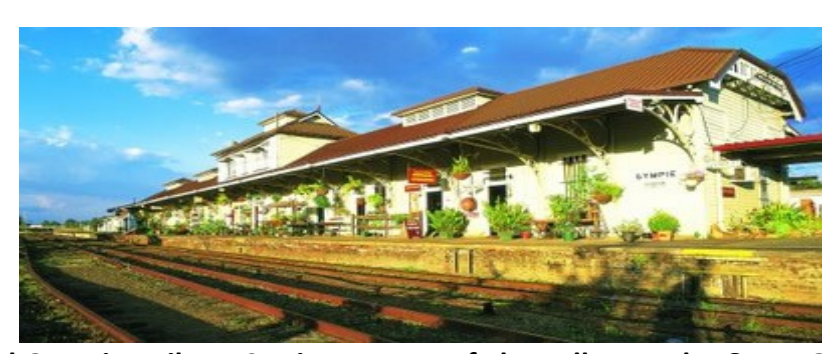
Old Gympie Railway Station - Home of The Valley Rattler & VK4GYM

Next Newsletter is due out around the end of August, 2014. Please submit articles to newsletter@gceginc.org.au